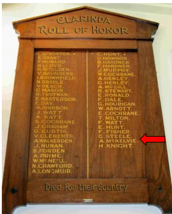
Clarinda Primary School Roll of Honour